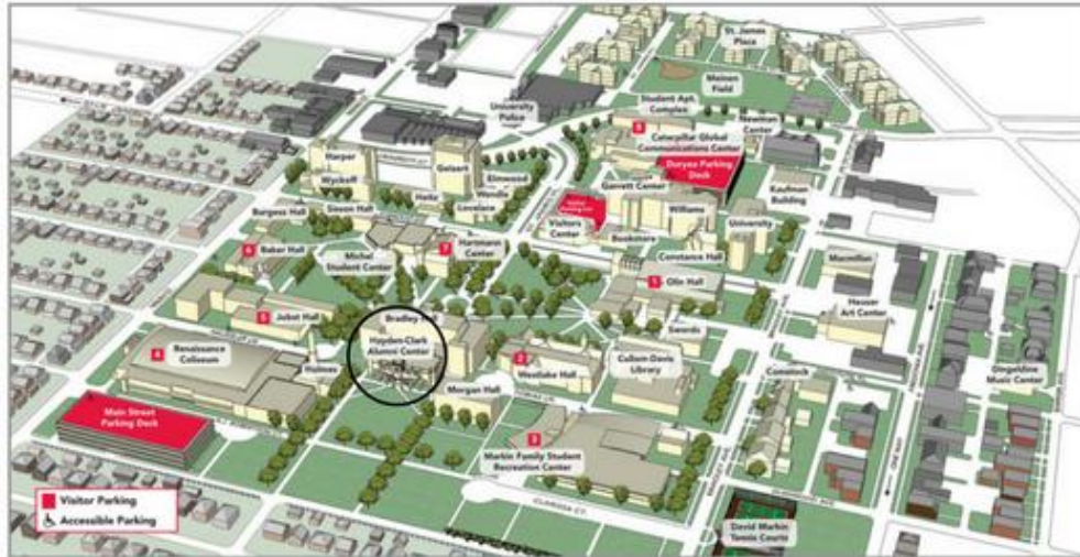
Bradley University Campus Map

This 2 nd Annual Healthcare Summit brings together a diverse group of high-profile global thought leaders from business, government, healthcare, industry, and education to the nation's heartland. The agenda features stimulating, cutting-edge presentations and interactive dialogue designed to advance high impact leadership, collaboration and innovation in the global economy. The Summit culminates with the 12th Anniversary Passage to India dinner and celebration held that evening at the Peoria Civic Center.